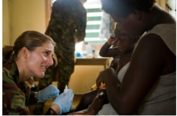
A New Zealand Army officer treats a child at the patrol's temporary medical clinic in Mbarama village, Solomon Islands

I was sitting in a quiet meeting room in Port Moresby when my reliably silent phone started ringing. I hung up. It rang again. With everyone looking at me, I tried to figure out how to turn it off.