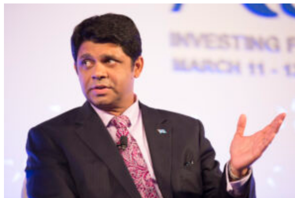
Aiyaz Sayed-Khaiyum, Attorney General and Minister of Economy, Fiji

Fiji's 2017-2018 budget is full of big spending promises aimed at winning votes as the 2018 election approaches. Budget papers project a sizeable budget deficit, equal to 4.5% of GDP (with an underlying deficit of 7.8% of GDP). Winners from the budget include civil servants, who see salaries (overall) increase an astounding 18% in one year; recipients of social welfare payments and tertiary scholarships, both of which have been expanded; and workers who will benefit from an increase in the income tax threshold (raised from $16,000 to $30,000). The Bainimarama–Sayed-Khaiyum government has never been one to shy away from deficit spending. However, this budget, delivered amidst positive economic conditions, is particularly notable in this respect.