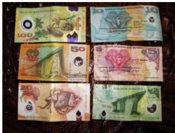
PNG money

Three years after their introduction in mid-2014, foreign exchange (FX) restrictions continue to be in place as at July 2017. Unofficial ballpark estimates of excess demand range between US$300 million to 1 billion.