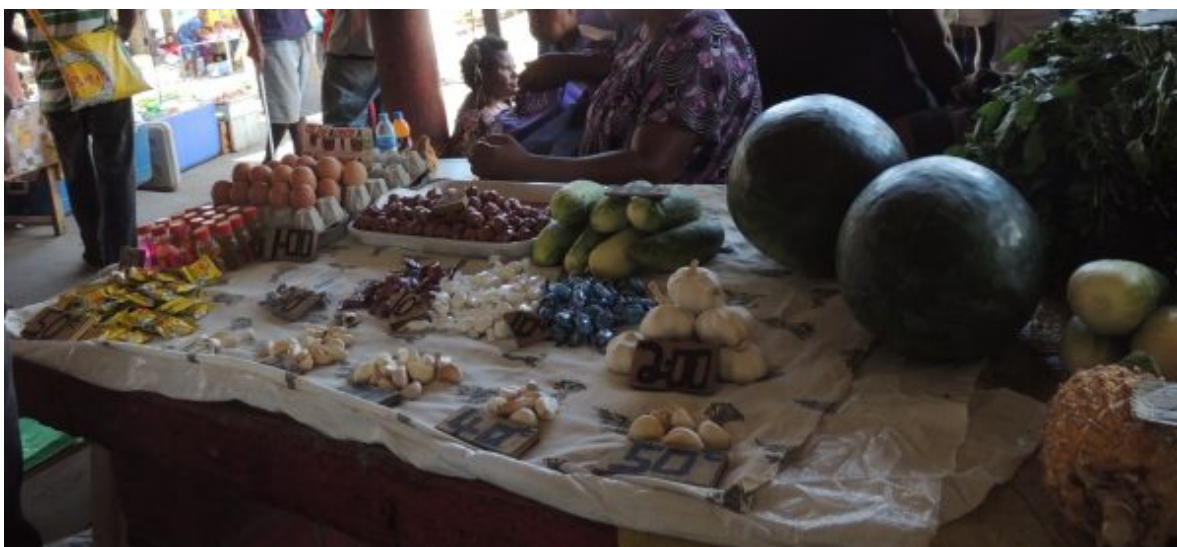
A vendor selling a mixture of store goods and fresh food, Kimbe Market (Timothy Sharp)

There have been changes in what is bought and sold. In the 1960s, almost all of what was sold in marketplaces was locally produced fresh food. But in the early 1970s, imported and manufactured goods were increasingly sold in some marketplaces, and now sometimes represent a high proportion of goods sold.