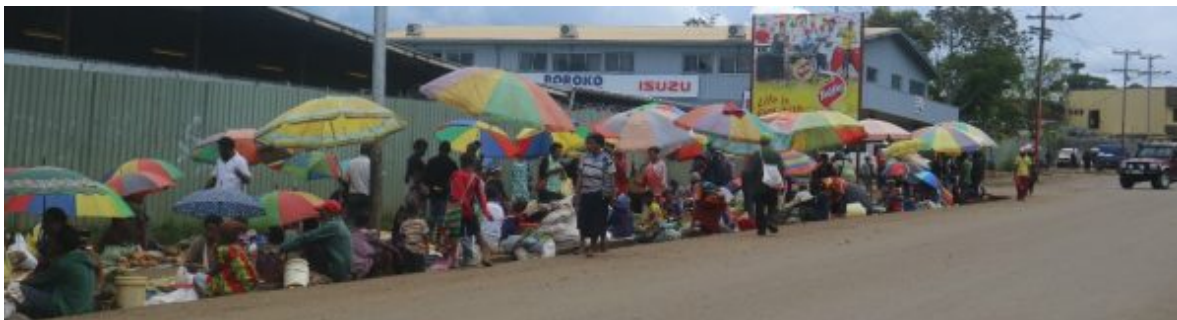
Seigu Market, Goroka

In the late afternoon, workers returning to their homes in the informal settlements of Council Camp and Banana Block stop to buy household items from the stores and fresh produce from the women sitting in front of the stores, as well as to chew betelnut and chat with their friends.