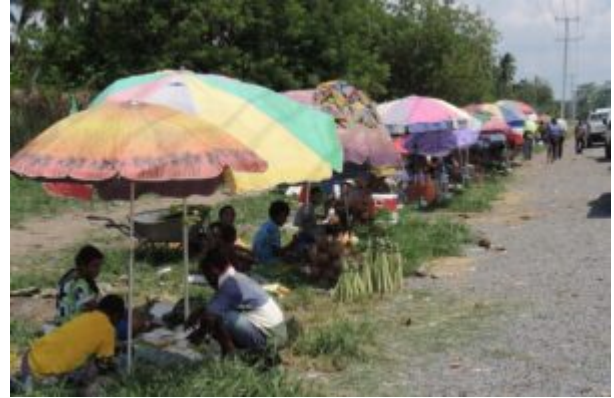
A roadside market in Hoskins, Papua New Guinea

In the mid-afternoon, in an area of West Goroka in Papua New Guinea known as Lopi, women gather in front of the small, run-down trade stores near the rugby league pitch and on the other side of the rutted dirt road. They spread canvas bags and pieces of plastic on the ground, onto which they put small piles of produce they want to sell. Some of this food is grown elsewhere and brought to Goroka in trucks travelling along the Highlands Highway – potatoes from Henganofi to the east, onions from Simbu Province farther west, and betelnut and peanuts from the lowlands in Madang and Morobe provinces. But most of it – including sweet potatoes, greens, bananas, cabbages and corn – is grown by the vendors themselves in small gardens in and around West Goroka.