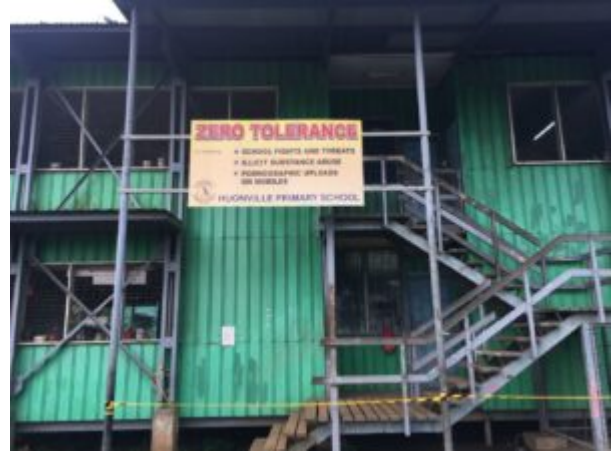
A sign at Huonville Primary School in Lae

Previously, we introduced our research project in Lae and provided some emerging results on the links between family and sexual violence (FSV) and financial hardship among the women we interviewed. This blog shares some emerging findings on the impact of FSV on school attendance, and the strategies used by schools to assist students experiencing periods of violence. It is based on interviews with 71 women, as well as senior staff in a number of Lae schools.