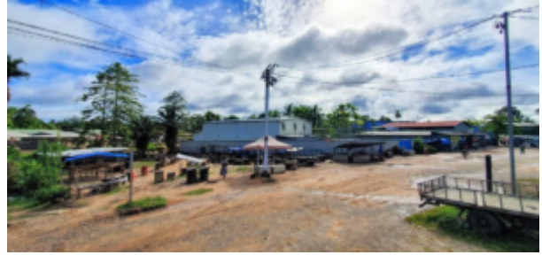
Market place at Kiunga, 24 March 2020, after COVID-19 'awareness' by police

The first COVID-19 case reached Papua New Guinea (PNG) on 13 March 2020, though it was several days before it was unambiguously confirmed. On 17 March the pandemic was declared a national security issue , and a State of Emergency came into effect on 24 March.