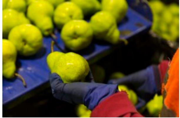
Packing pears