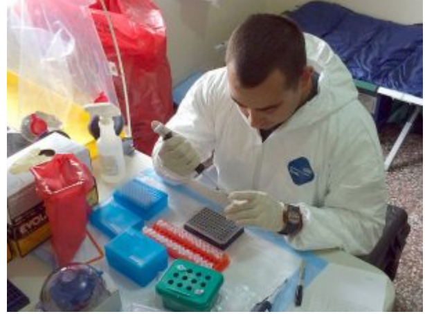
Naval medical research centre lab, Liberia

A couple of weeks ago, the Foreign Minister announced the biggest aid initiative in her five years of presiding over the aid program. Endowed with $300 million over five years, the Health Security Initiative for the Indo-Pacific Region dwarves the Minister's other big initiative, the innovationXchange, which was launched in 2015 with $140 million over four years.