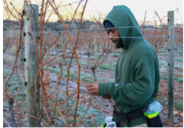
RSE worker in Queenstown