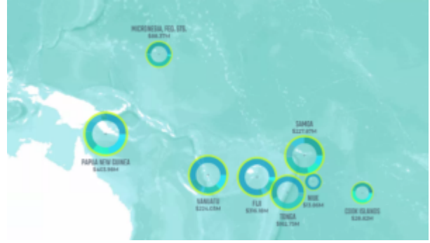
The Lowy Institute's Pacific Aid Map

The Guardian is far from the worst offender in reporting on Chinese aid (that award goes to the Sunshine Coast Daily, which helpfully told readers last year that “China almost has Australia surrounded”). The Guardian is, however, guilty of repeatedly making misleading statements about how much aid China gives to the Pacific. Others are also doing this, but the Guardian’s reporting combines all the main errors in a few short sentences. As a result, it’s a great teaching tool.