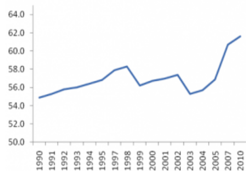
Figure 2. PNG life expectancy from HDR reports.

But PNG’s figures for life expectancy in the HDR are made up. The only calculations of life expectancy in PNG from nationally collected data are those of the demographer Martin Bakker: 49.6 years and 54.2 years in the 1980 and 2000 censuses respectively, figures below all points on the detailed HDR graph (Fig. 1). With the HIV-AIDS epidemic taking hold in PNG in the last decade, life expectancy might be going down again: we really have no idea.