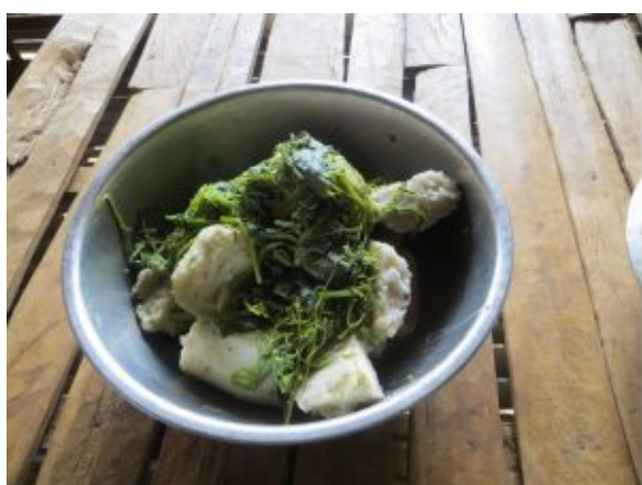
Evening meal of taro and choko tips, Fuma Village, June 2014.

Training women in improved cooking techniques and cooking certain processed foods can help improve nutrition. This was a successful component of the livelihood program of the PNG LNG project. The program involved facilitating the formation of women's groups, distributing ovens made from discarded 200-litre fuel drums and training women in food processing, hygiene and human nutrition.