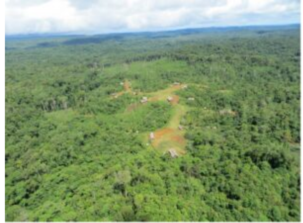
Aerial view of a remote village, Strickland-Bosavi area, PNG