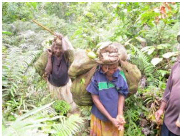
Group of women returning from harvesting bananas, taro and other foods from garden, Fuma Village, June 2014.

Improved techniques for growing food have the potential to reduce labour inputs, particularly benefitting women. Greater cash income benefits villagers, by helping to: improve child nutrition ; facilitate purchasing food when subsistence production is inadequate ; improve lives through purchases of basic items such as soap, salt, cooking oil, fishing equipment, torches and batteries; pay school fees; and purchase basic agricultural tools and other agricultural inputs.