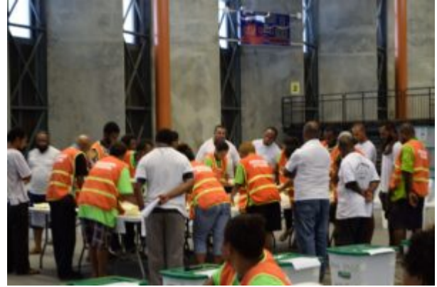
Election officials sort votes during PNG's 2017 national election

Papua New Guinea's roll of voters registered in national elections (the common or electoral roll) has been plagued with problems since at least the 1987 elections. Ever since 1987, the number of registered voters on the roll has exceeded the estimated voting population aged 18 years and over.