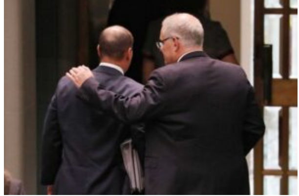
Australian PM (right) and Treasurer (left)

In March 2013, former Liberal Finance Minister Nick Minchin “re-entered the political fray” as The Australian reported it, sympathetically of course, and made the fiscal case for aid cuts, arguing: “At the moment, because the government is in deficit, we are borrowing money overseas... [W]e’re going to be sending that money back overseas to other countries – it is quite a silly position to be in.”