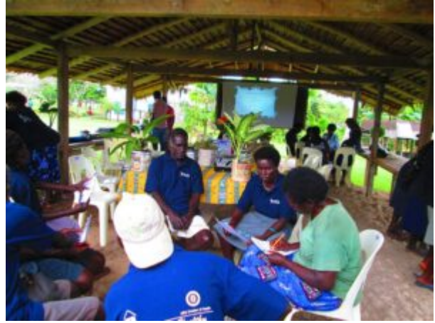
Group discussion between Local Village Health Volunteers as part of a BHCP orientation exercise in the Bana District in 2014

The case of the Bougainville Healthy Communities Program (BHCP) stands as a testament of how an organisation can work effectively in PNG in delivering critical services. BHCP started as an off-shoot of the successful implementation of the leprosy elimination program in Bougainville funded by the New Zealand government in 2001. Following the success of the leprosy program, a new project proposal was submitted to New Zealand Aid to promote health awareness. In 2006 the program was rolled out in three of the 13 districts in Bougainville, with a small group of staff that included the program manager and three district facilitators.