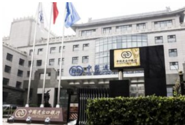
Beijing branch of the Export-Import Bank of China

Recent media coverage has touted the rise of Chinese aid and lending as a threat to Pacific nations’ sovereignty and to the West’s influence in the Pacific. China, so the narrative goes, is aggressively lending to smaller nations who do not have the capacity to pay back the loans. Some commentators have even described such lending as “ debt-trap diplomacy ”, implying that lending forms part of an intentional strategy by the Chinese state to pressure Pacific island governments.