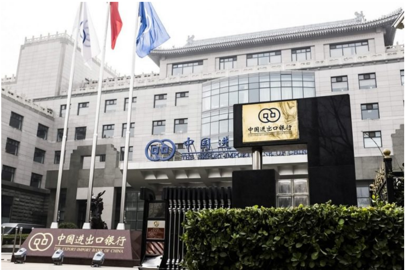
Beijing branch of the Export-Import Bank of China