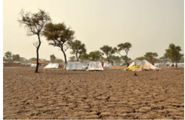
Jamam refugee camp in South Sudan