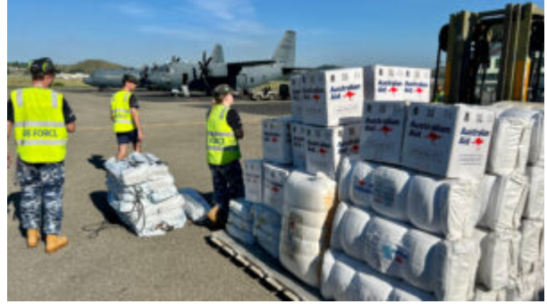
Humanitarian supplies en route to the 2024 Mulitaka landslide response effort in Enga province, PNG