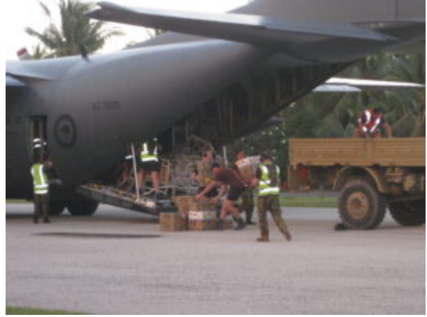
Unloading supplies as part of an exercise testing New Zealand's ability to respond to a natural disaster in the Pacific

In mid-September, the Center for Global Development released the latest iteration of its Commitment to Development Index . The index ostensibly measures wealthier countries' commitment to improving our planet. Commitment is measured across areas ranging from aid to trade.