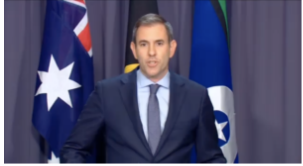
Treasurer of Australia, Hon Dr Jim Chalmers