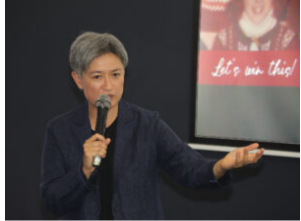
Senator Penny Wong at an ALP fundraising event last year