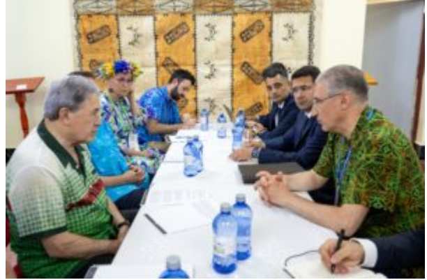
COP29 President-Designate Mukhtar Babayev with New Zealand Foreign Minister Winston Peters on the sidelines of the 2024 Pacific Islands Forum