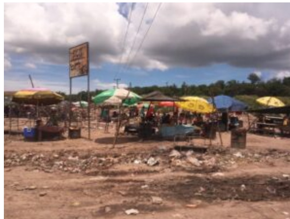
Morning market in Geruhu, Port Moresby

The concept of microfinance is not new. The form of microfinance services we see today is largely derived from the community-based mutual credit transactions that existed centuries ago and that were based purely on trust and non-collateral borrowings and repayments. The first microfinance service in Papua New Guinea (PNG) was introduced by the Asian Development Bank (ADB) in 2002 under the Microfinance and Employment Project . Today, microfinance services in PNG are supplied through the state-owned National Development Bank , five licensed microbanks, 21 savings and loans societies (SLS) and around 70 small community-based non-government organisations .