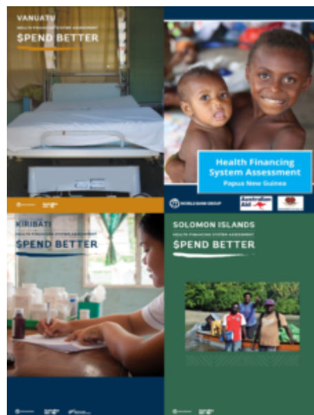
Covers of the World Bank Health Financial System Assessments

As population grows and as the prevalence of chronic and complex diseases increases, the cost of delivering health services in the Pacific is on the rise. Non-communicable diseases (NCDs) have become the biggest contributor to the burden of disease, while the unfinished agenda of reproductive, maternal and child health, malaria, tuberculosis and HIV continues to significantly affect some countries. In all Pacific countries, deaths from NCDs outnumber deaths from communicable diseases.