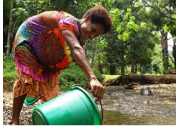
Collecting water in Yiwun village, Wewak District, PNG