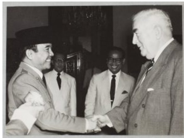
Menzies and Sukarno, December 1959