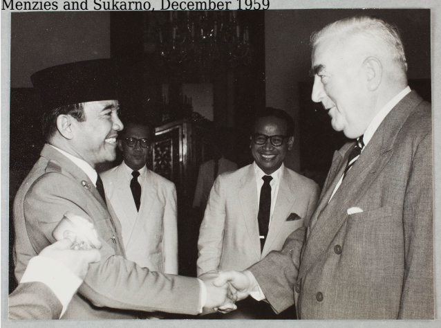
Menzies and Sukarno, December 1959