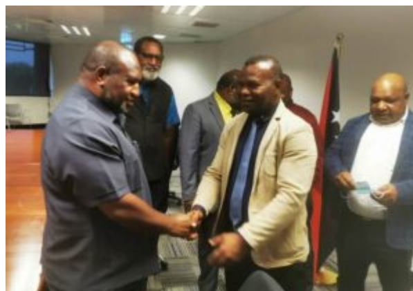
PM Marape oversaw a cabinet reshuffle in April 2022