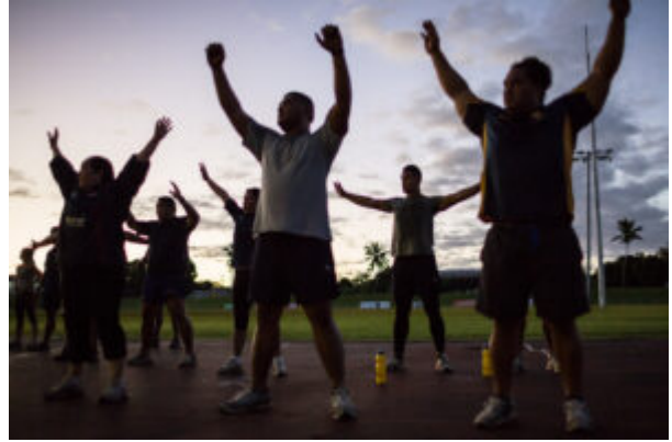
Early morning exercise in Tonga