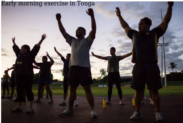
Early morning exercise in Tonga