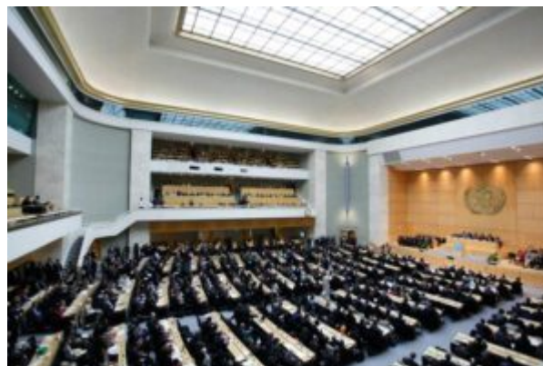
Delegates at the 66th WHA session Geneva 2013.

From May 20 to 28 the World Health Assembly (WHA), the WHO's decision-making body, convened in Geneva. The WHA, held annually, is a major event on the international public health and development calendar, and this year was no different.