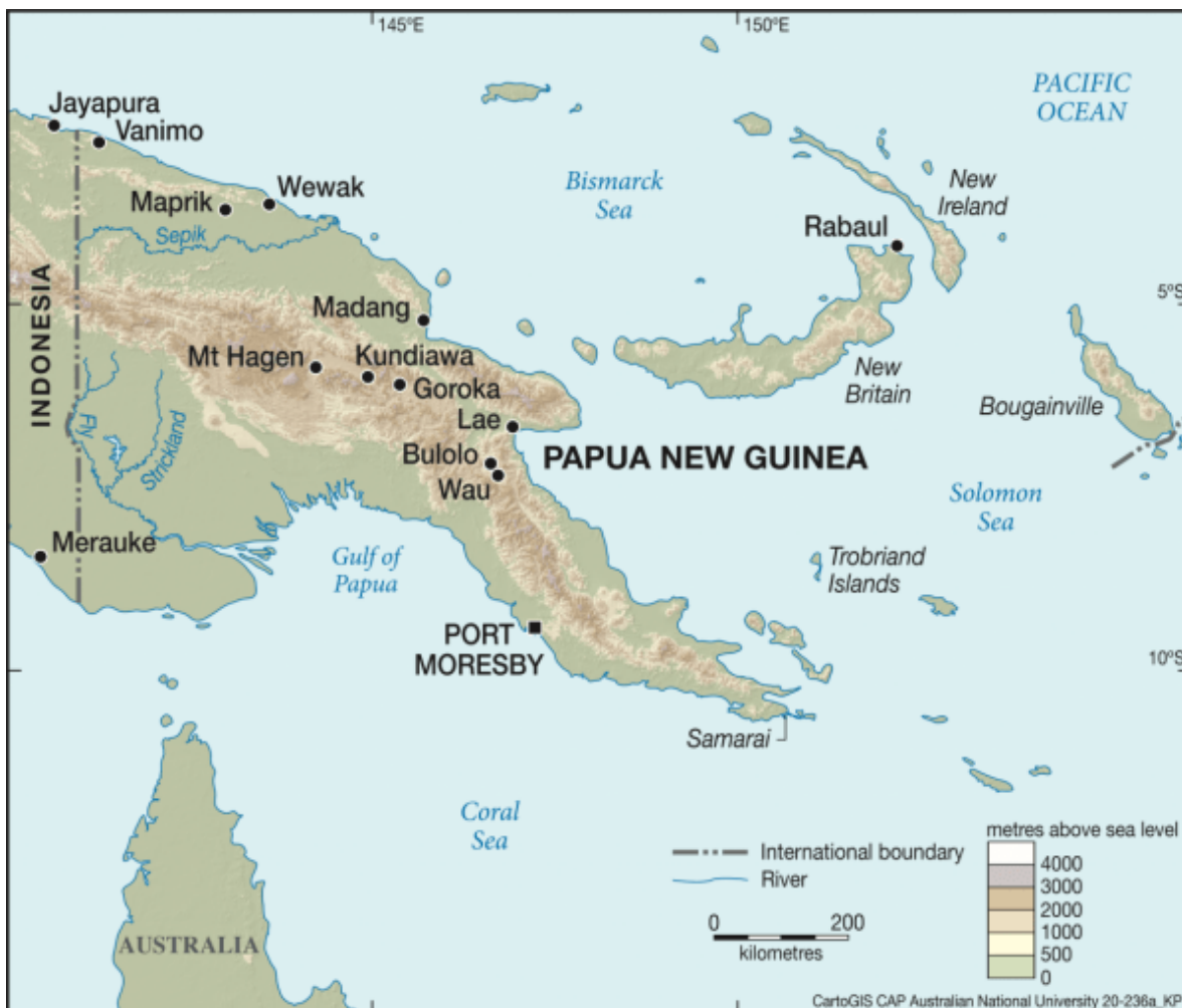
Modern PNG with major urban centres

My colonial narrative focuses on the experience of three urban places and their respective hinterlands. Two of these – Rabaul and Goroka – are seen as ‘lucky’ places while the third – Port Moresby – had to make its own luck. Part of Rabaul’s ‘luck’ lay in its having an immigrant Chinese population. Recruited as artisans and intermediaries by colonial capital, many Chinese quickly became independently employed and demonstrated the entrepreneurial energy of Monsoon Asia to Rabaul’s Melanesian population. These three parallel cases offer instructive comparisons between German and ‘Anglo’ (British/Australian) colonial ideologies, and their consequences. Since colonial regulatory and normative frameworks were derived from ideologies imposed by the European powers there is also some discussion of imperial understandings of ‘primitive’ economic systems, and of how these influenced colonial economic policy.