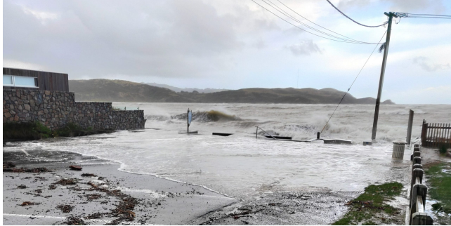
A storm surge inundating Wellington houses. (Terence Wood)