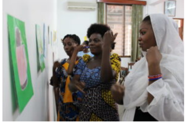
Australian community aid in Tanzania