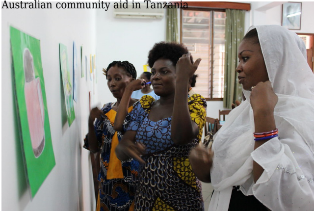
Australian community aid in Tanzania