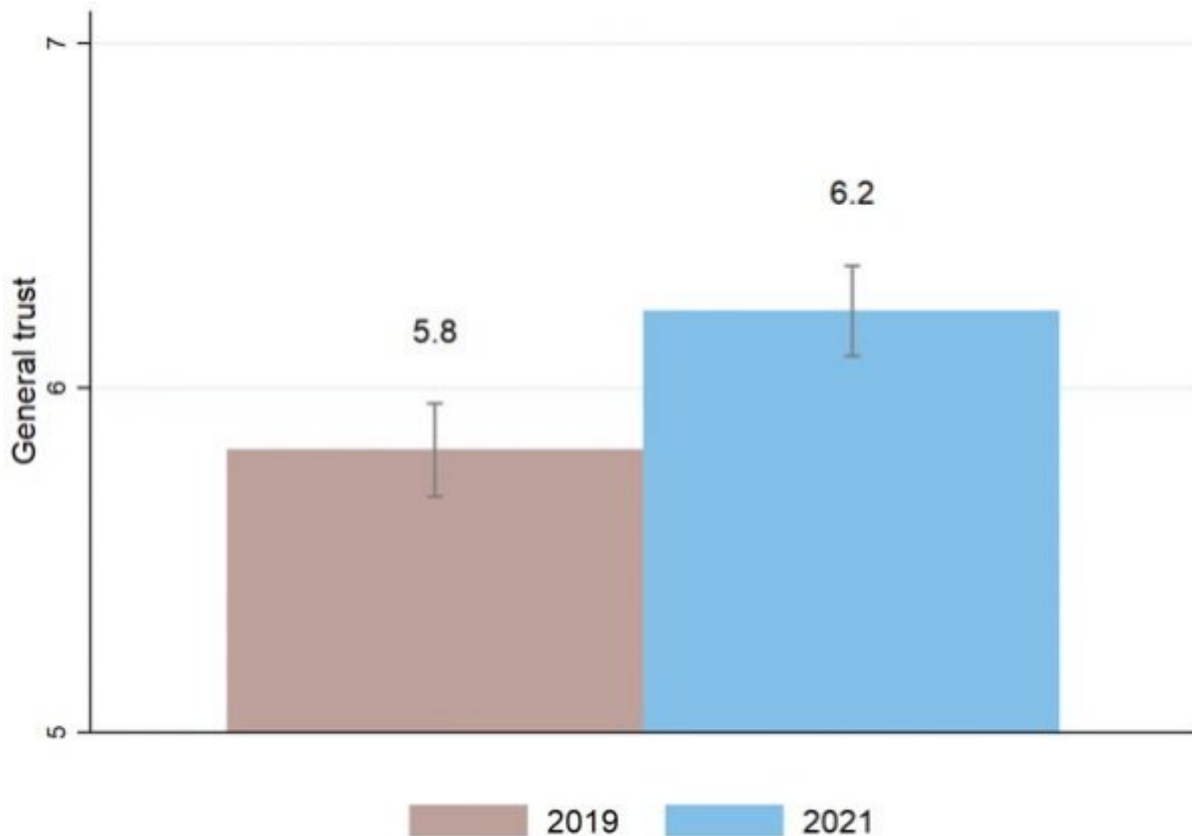
Mean surveyed general trust – 0 to 10 scale

My findings do not appear to be unique. The Edelman Trust Barometer, which is fascinating, but which I would trust more if it came coupled with a clearer explanation of its survey methods, also finds increasing trust in a range of Australian institutions.