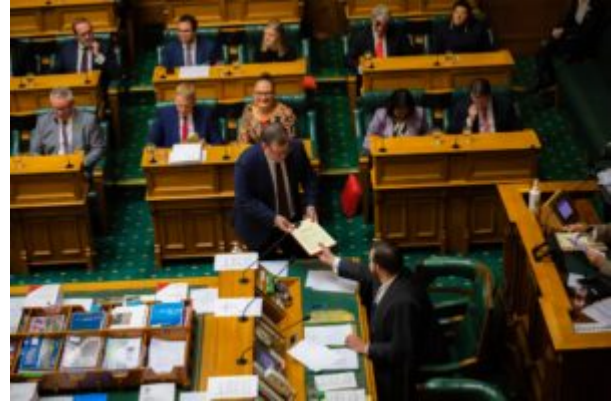
New Zealand's Minister of Finance, Grant Robertson, delivers the budget in parliament, 18 May 2023