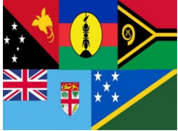
Melanesian Spearhead Group member flags.