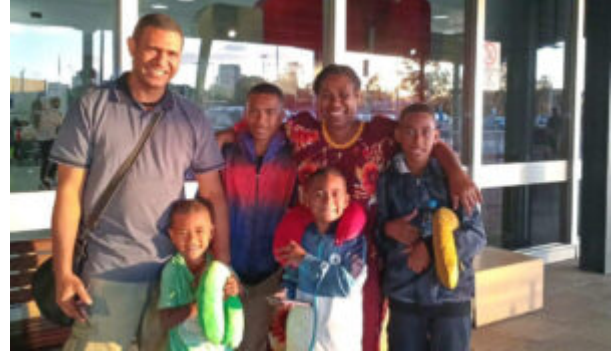
One of the first Papua New Guinean families to have migrated to Australia on a Pacific Engagement Visa.

In August, we published a progress report on how the successful Pacific Engagement Visa (PEV) 2024 ballot applicants had fared, but at that time we only had data up to April. Now we have more recent data from the Department of Home Affairs, up to end of July. (Note that we are writing exclusively about the 2024 PEV round; the 2025 PEV ballot closed on 25 August and winners have already been notified.)