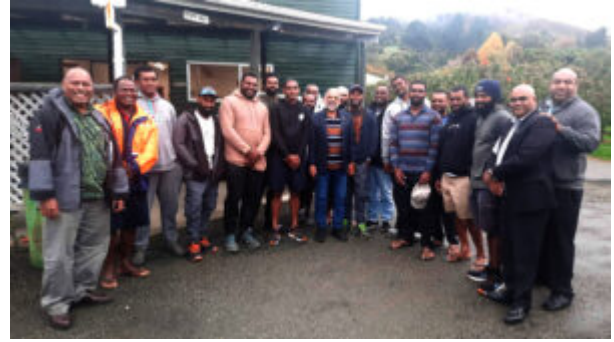
Fiji Employment Minister Agni Deo Singh visiting seasonal workers in New Zealand in May 2023