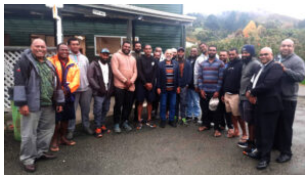
Fiji Employment Minister Agni Deo Singh visiting seasonal workers in New Zealand in May 2023