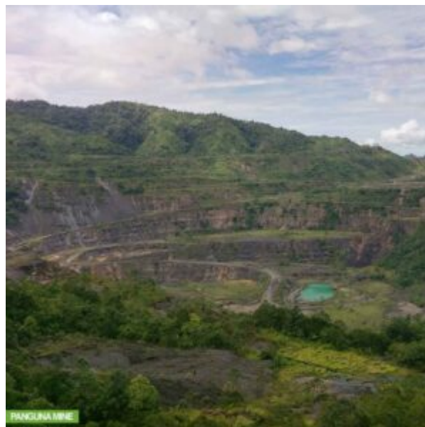
Panguna Mine

Government revenues from Papua New Guinea's mining, oil and gas sector have essentially dried up. With the ongoing effects of the devastating earthquake in Hela province, the eruption of election-related violence in the Southern Highlands, a significant budget shortfall, and a foreign exchange crisis driving business confidence down, the resources of the government are severely stretched... and the massively expensive APEC meeting looms in November.