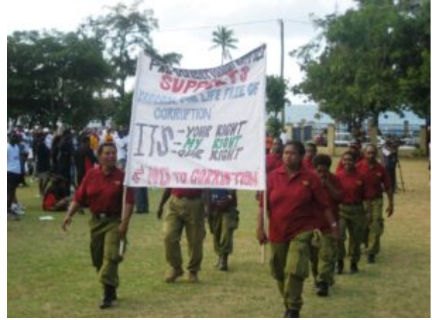
2008 Walk Against Corruption, Port Moresby

In 2020 we found that, over the previous decade, support for anti-corruption organisations in Papua New Guinea had gone through a boom-and-bust cycle. This cycle, also observed in other parts of the world, sees new governments come in with strong anti-corruption rhetoric and policies, initially allocate more funds to anti-corruption organisations than the previous government, and even set up new organisations to tackle corruption (the boom). However, over time, as corruption scandals come to light, the government underspends and undermines the very anti-corruption organisations it initially promised to support (the bust).