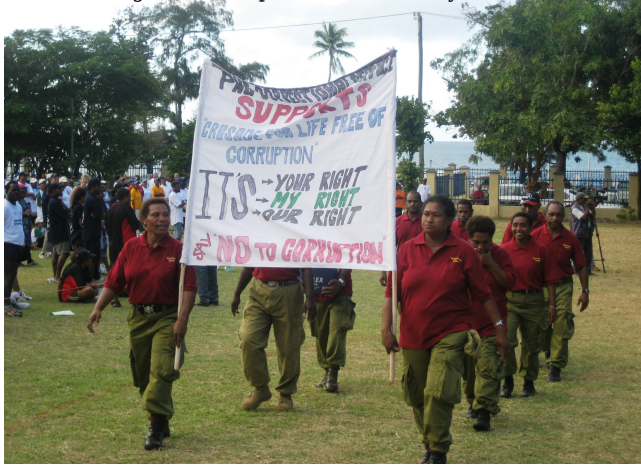
2008 Walk Against Corruption, Port Moresby