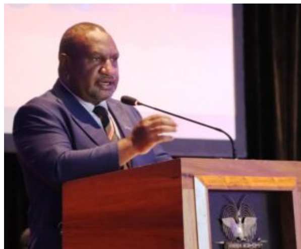
Prime Minister Hon. James Marape launching PNG's Infrastructure Development Programme in August 2020