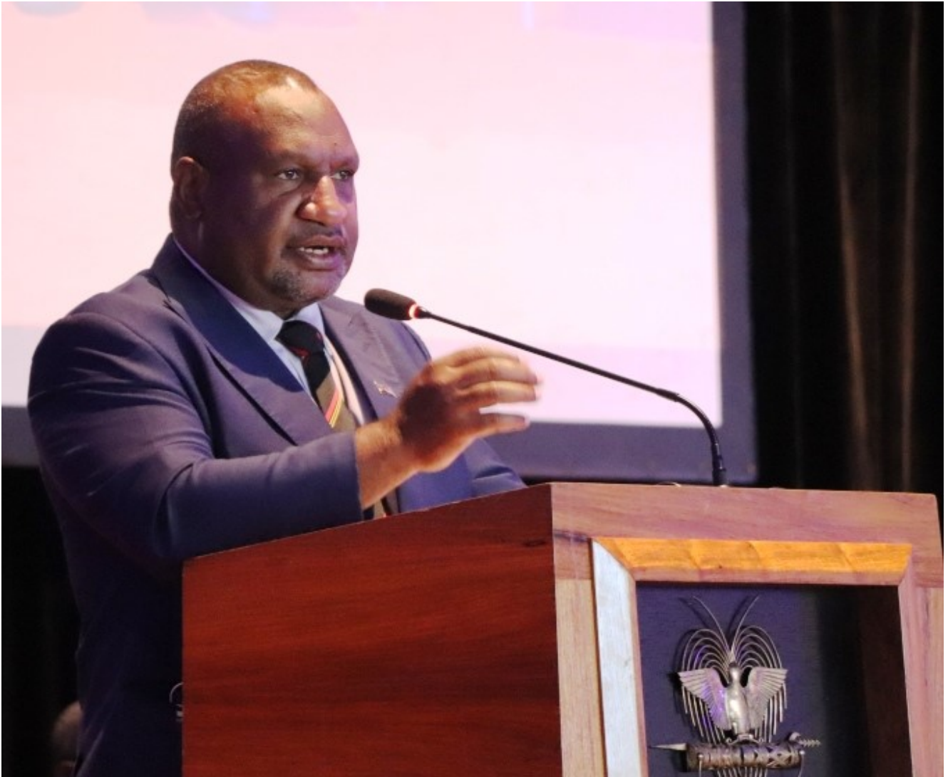
Prime Minister Hon. James Marape launching PNG's Infrastructure Development Programme in August 2020