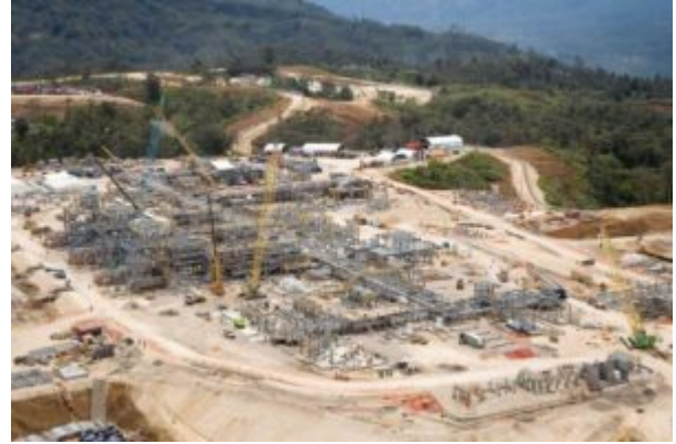
ExxonMobil LNG plant in Southern Highlands

PNG's extractive sector is set to expand, with the construction of the next mega-project – the Papua LNG project – about to start this year. In light of this, a new discussion paper analyses the employment and skills development impacts of the Liquefied Natural Gas (LNG) project in PNG. Lessons from the US $19 billion PNG LNG investment, the largest resource project ever completed in the country, can inform workforce development for future projects.