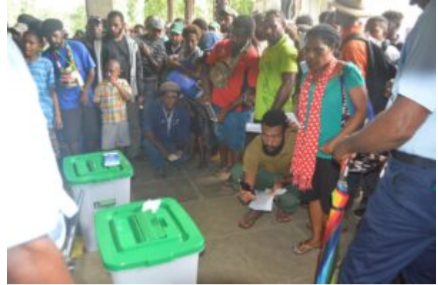
People gather for the 2017 PNG elections