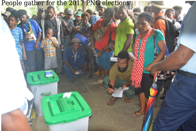
People gather for the 2017 PNG elections