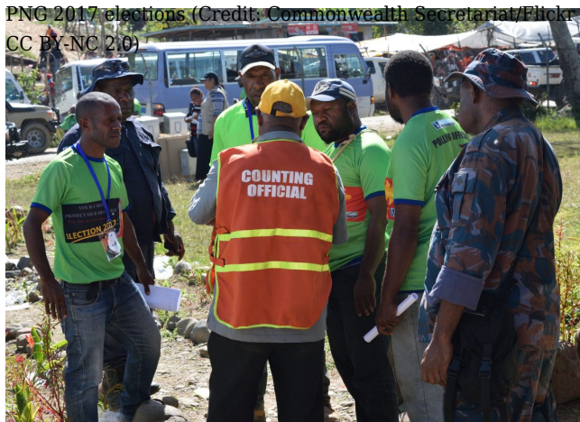
PNG 2017 elections